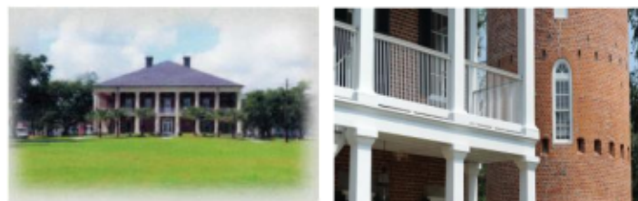
Jackson Barracks, New Orleans, LA

http://geauxguard.com/organization/installations/jackson-barracks/